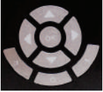
4 Navigate with Buttons