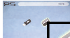
6 Select SD Card