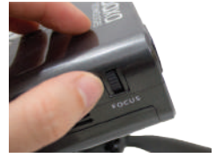
3 Focus the Image