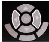
8 Adjust volume