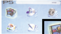
5 Select Movie