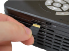
1 Insert Card