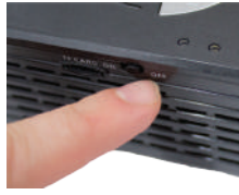
2 Power On projector